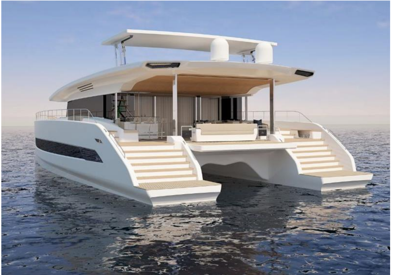
Silent 79 render

In addition, a "Hybrid Power" version of the Silent 79 has a pair of 220 HP motors combined with two 14 kW diesel engines.