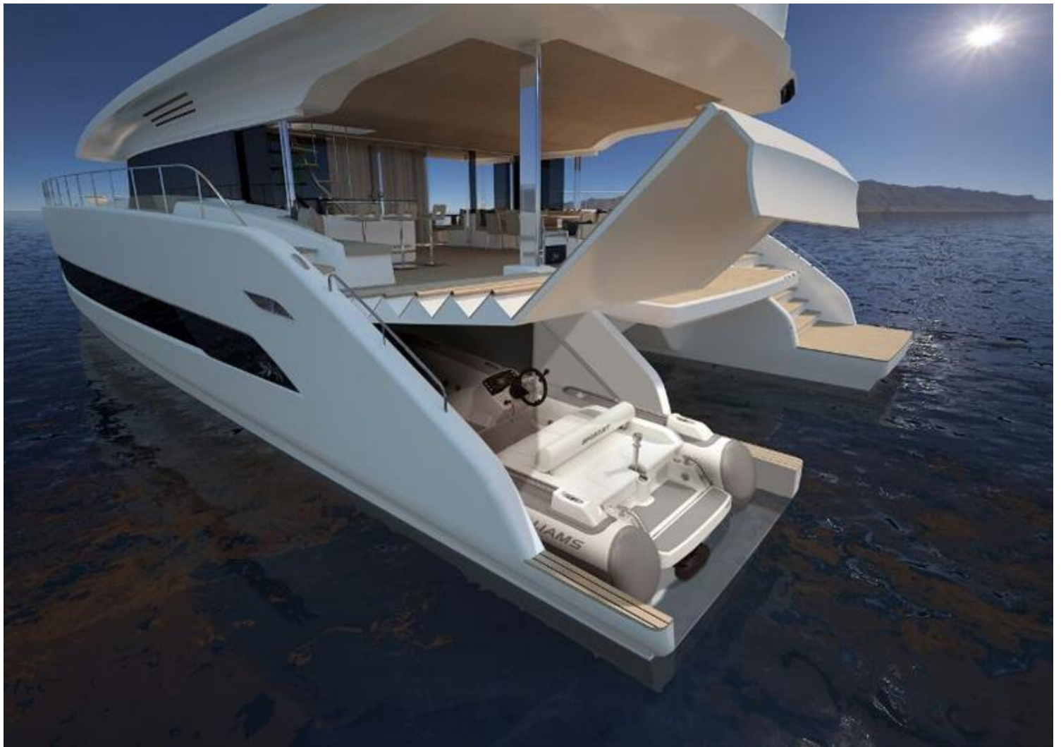
Silent 79 render - Tender Garage - photo © Silent Yachts

sufficient and virtually maintenance-free. The catamaran is fitted with a pair of electric engines (50 kW each in standard "Cruiser" version, 250 kW each in "E-Power" version) and common shafts. In the most powerful version, the Silent 79 can reach up to 20 knots but this yacht's mission is not focused on speed for sure. However, it offers total autonomy with no fuel, fumes, exhausts or noise.