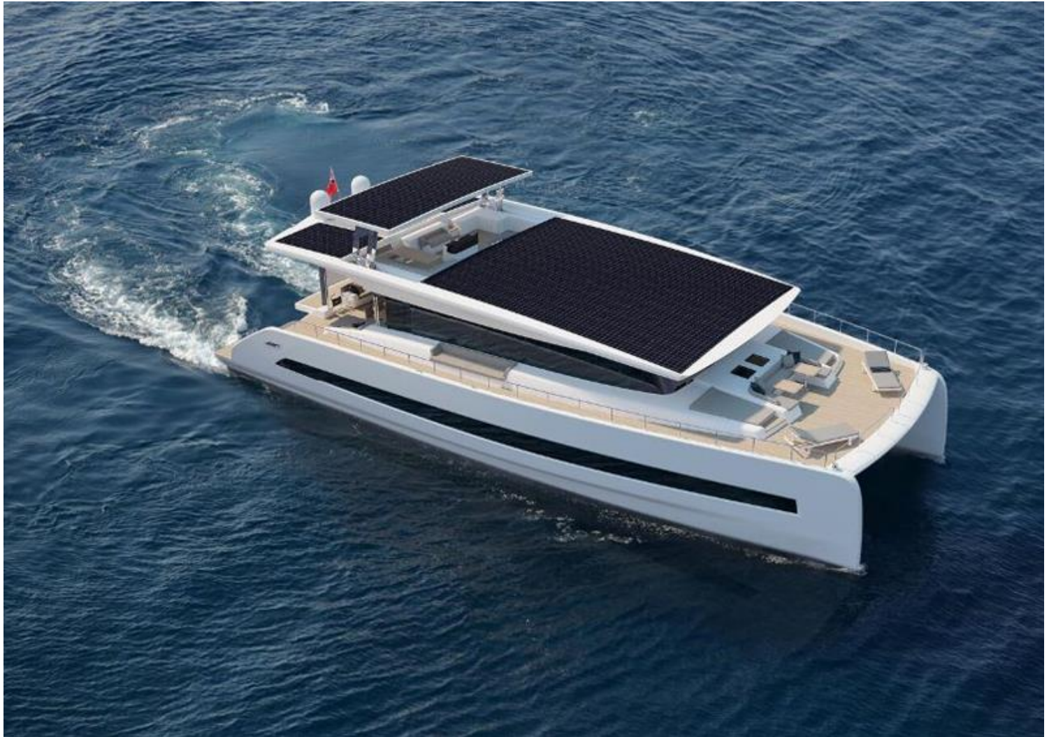
Silent 79 render exterior cruising

Silent-Yachts, Austria-based producer of ultra-innovative oceangoing solar-powered catamarans, is making a big leap in size introducing its largest model to date.