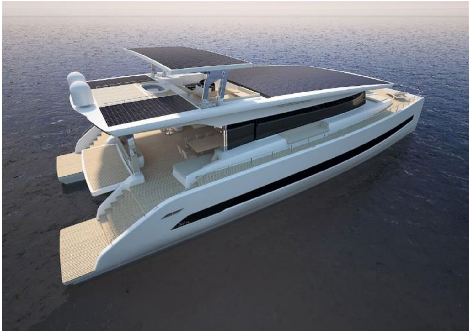
Silent 79 exterior - photo © Silent Yachts

Silent-Yachts' heritage is about being green and eco-friendly, the yacht is principally decorated with lightweight and recyclable materials that respect the environment.