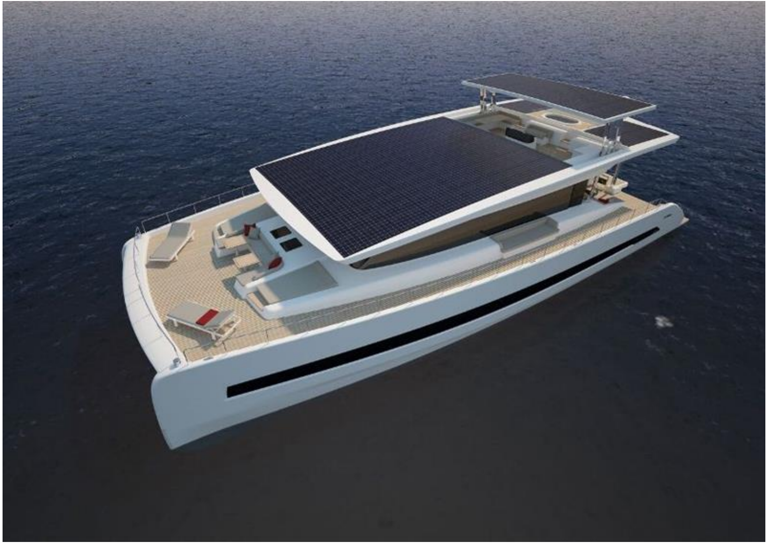
Silent 79 render