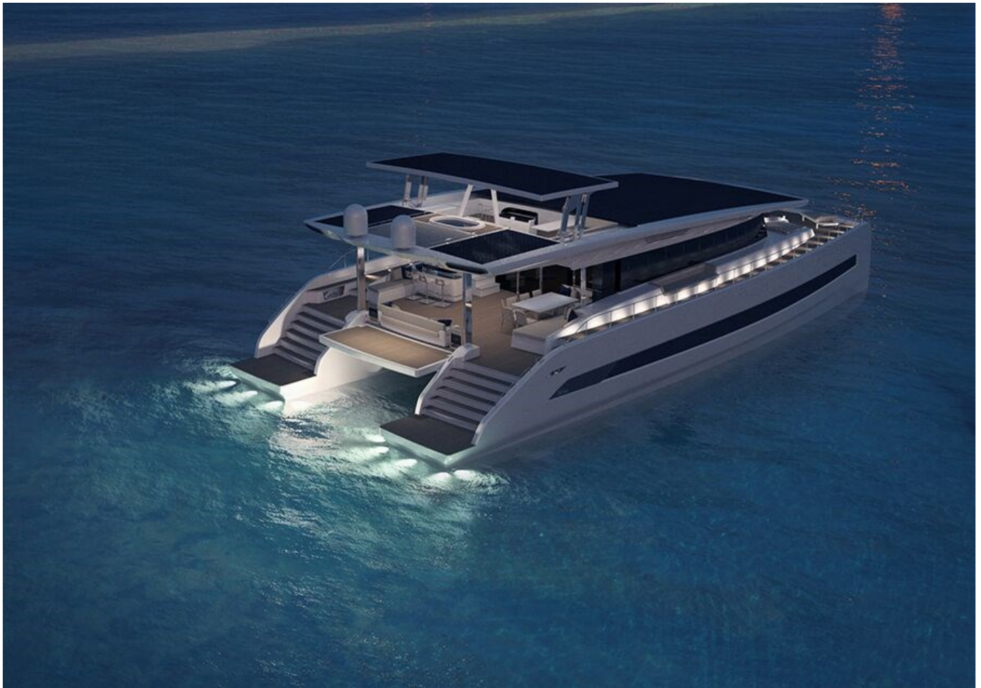
The Silent 80

Silent-Yachts, the innovative Austrian company that produces the first and only oceangoing solar-electric production catamarans in the world, is delighted to announce that its flagship model now named the Silent 80 (previously Silent 79) records 4 units sold in few months. The first unit of the Silent 80 model was sold