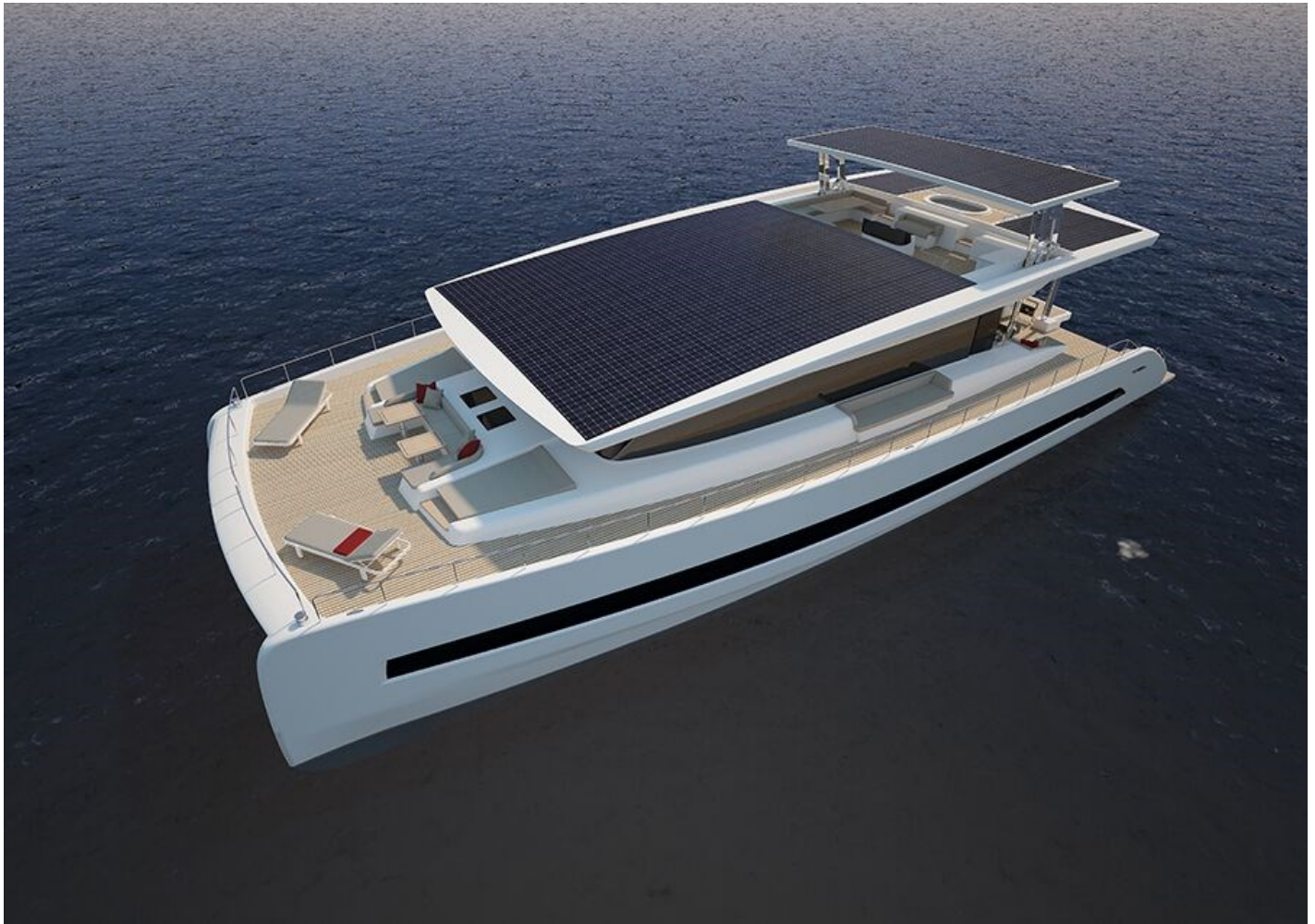
The Silent 80

The catamaran is capable of going at 6-7 knots in complete silence and with unlimited range passing around 100 nautical miles per day. With 70 high-efficiency solar panels rated for approximately 25 kilowatt-peak, the Silent 80 uses maximum power point tracking (MPPT) solar charge regulators and the same lithium batteries as used by Tesla, which provide capacity for all-night cruising, while a 20-kVA inverter provides power for all household appliances. The energy production and propulsion systems require hardly any maintenance and produce no fumes or noise. Because of that, the operational costs of the vessels are substantially lower compared to power yachts using traditional propulsion systems.