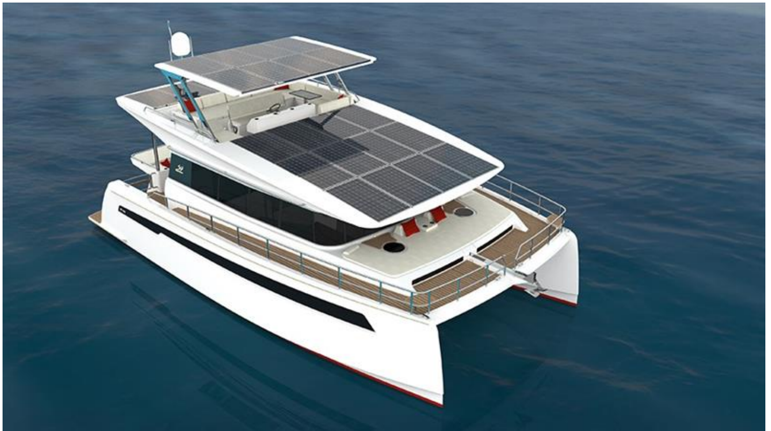
Silent 44

The Silent 44 is going to be an entry model of the range. The smallest ever Silent-Yachts' catamaran is an oceangoing solar electric boat that meets the highest ship building standards, respects the environment and makes no compromises regarding luxury cruising at the same time.