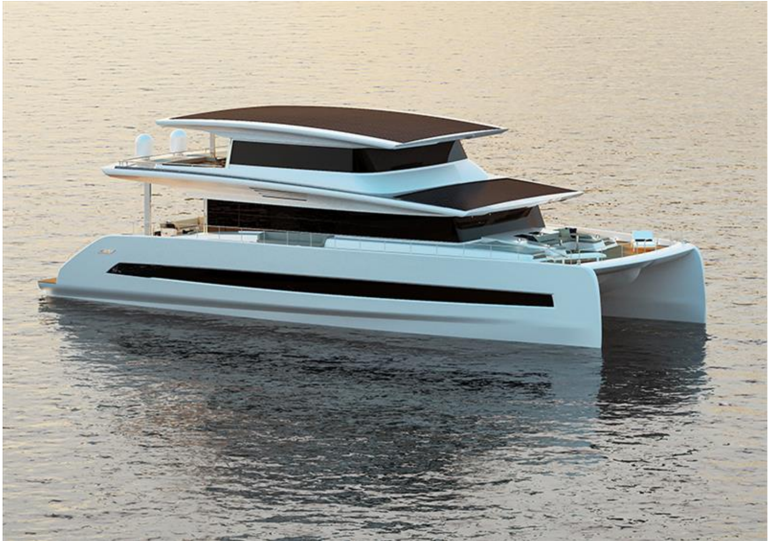
Silent 80 Tri-Deck

Silent-Yachts, the innovative Austrian company that produces the first and only oceangoing solar-electric production catamarans in the world, has announced the expansion of its range at the Cannes Yachting Festival 2019. The shipyard is adding three new models: the Silent 44, Silent 60 and a tri-deck version of the flagship Silent 80.