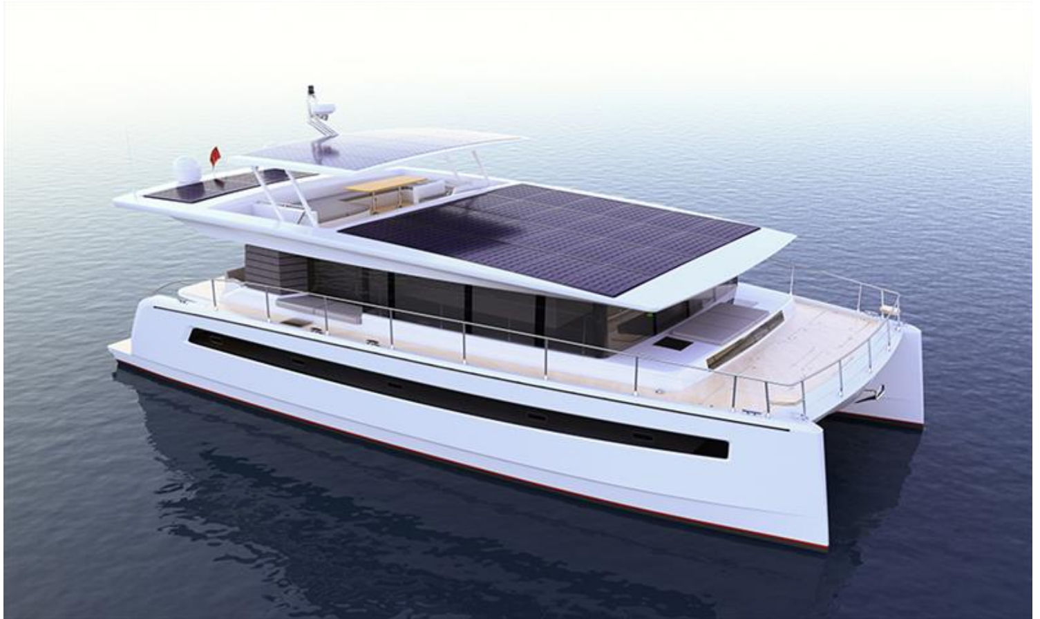
Silent 60

In addition, the storage space of the 60-footer is much larger, has higher headroom and more powerful solar panels: 42 pieces for 16.8 kWp compared to 30 for 10.8 kWp of the Silent 55. The Silent 60 is a true world cruiser.